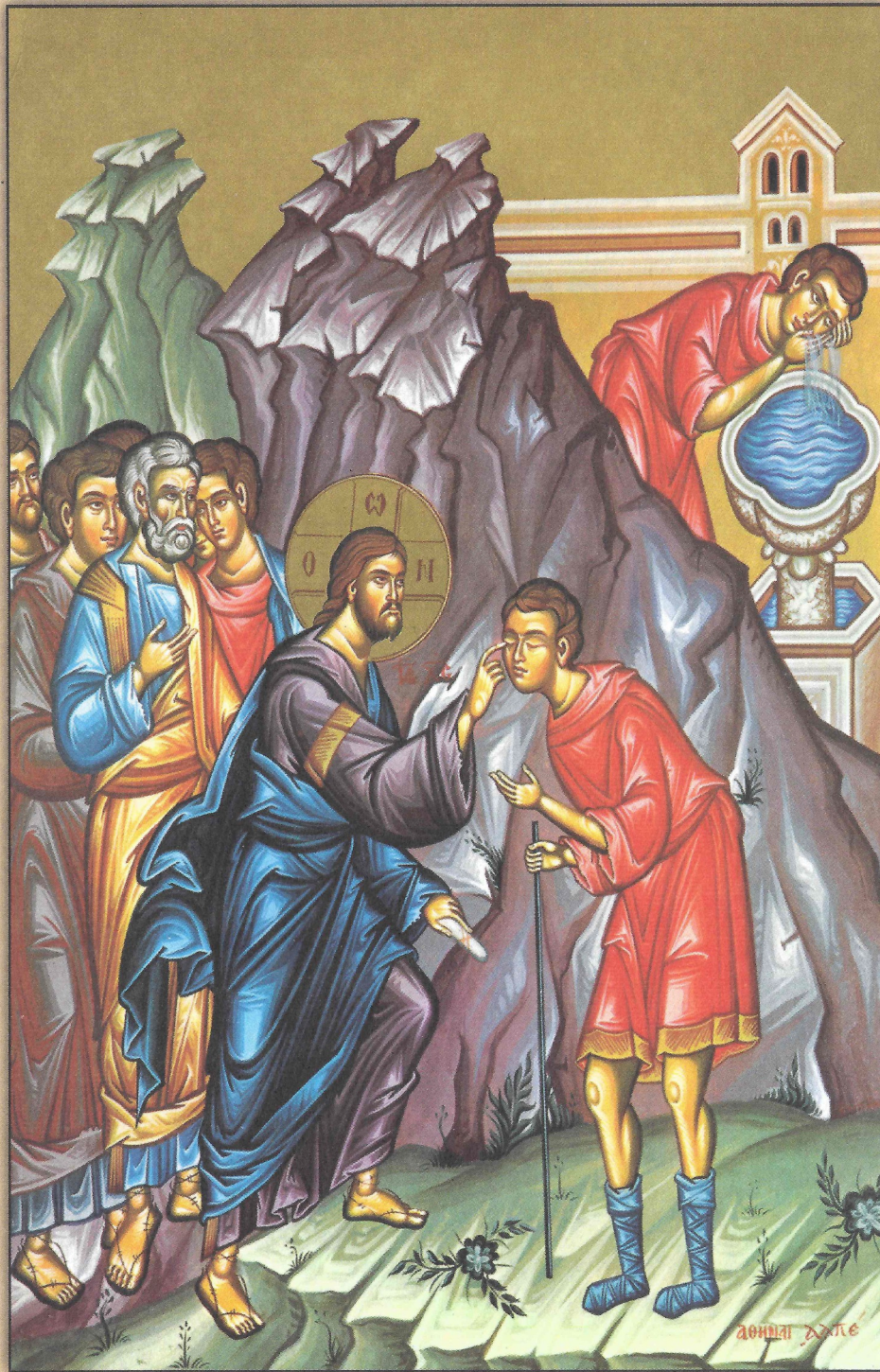
Icon of the Gospel of the Man Born Blind